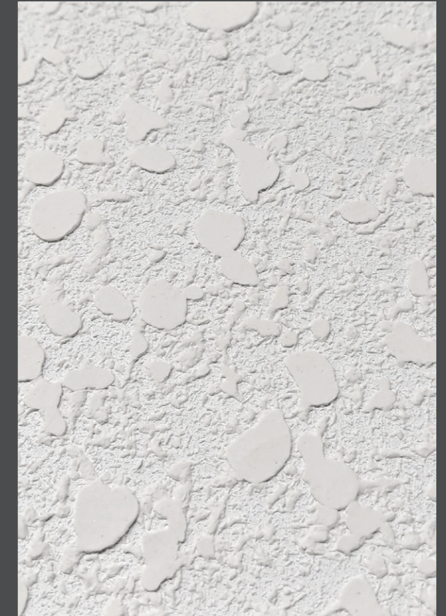
JUMBO-HEAD CUT (L)