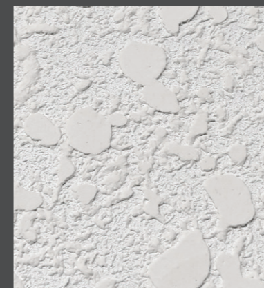
JUMBO-HEAD CUT (L)