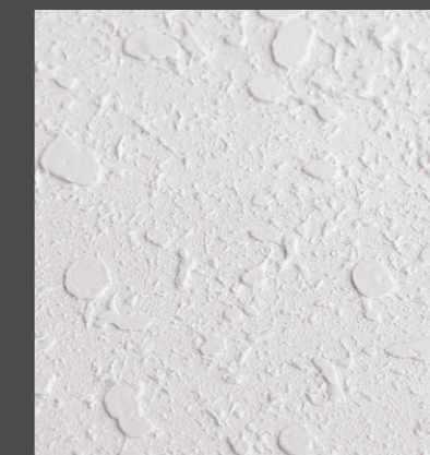
JUMBO-HEAD CUT (M)