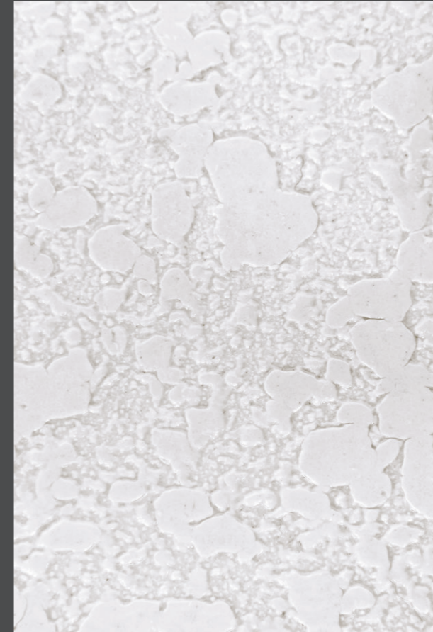
JUMBO-HEAD CUT WITH PU COATING (L)